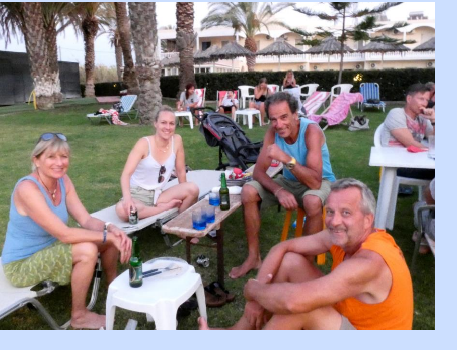
Lifestyle part 2: BBQ @ Anemos