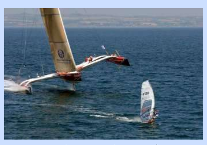
Keep at least 5m distance from water vehicles und sail.